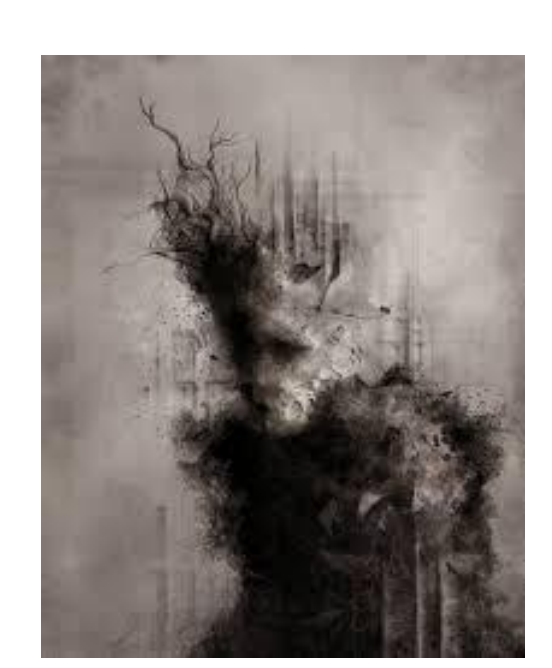
"The Weight of Silence"